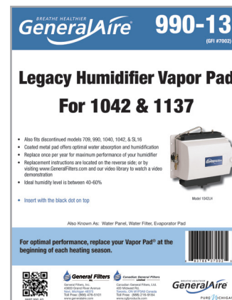
990-13 Vapor Pad® (GFI #7002)