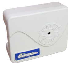
Water Savor Controller Reduce water use by a minimum of 50%!