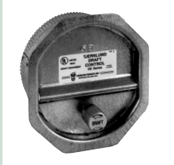
B Series: Double Acting Standard Control for Gas Heating Appliances.