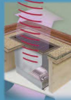
ASLL Level-To-Level Transfer Fan