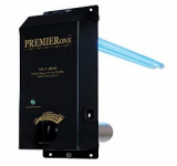
Premier One MUV-403H

Complete whole home active air purifier combining multiple technologies to offer best in class, active air purification indoors targeting bacteria, viruses, odors, volatile organic compounds, respirable particulate, and more. IPG utilizes multiple technologies to purify indoor air including UV light, Photocatalytic Oxidation, and dedicated dual polarity Ionization. IPG 14" has 8 to 10 times more catalyst surface area and 3" more UV light than REME Halo, Air Scrubber, Air Oasis Nano and more. IPG also produces ionization at a much higher rate than its competitors