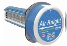
Air Knight IPG