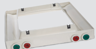
Green & red drain pan plugs to identify primary vs. secondary